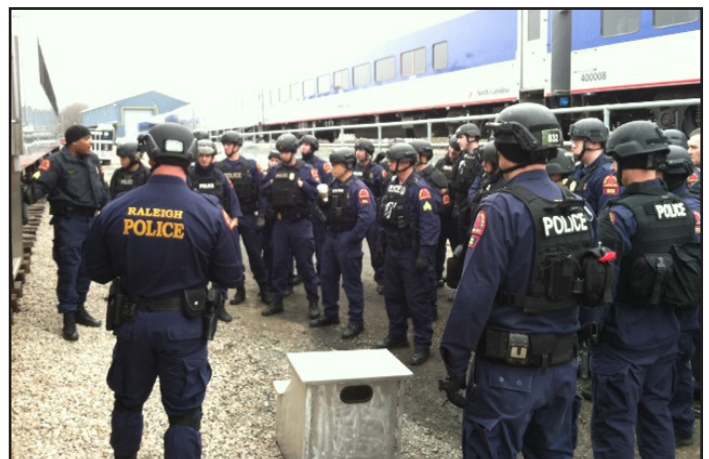
Raleigh PD SWAT team training at NCDOT Capital Yard