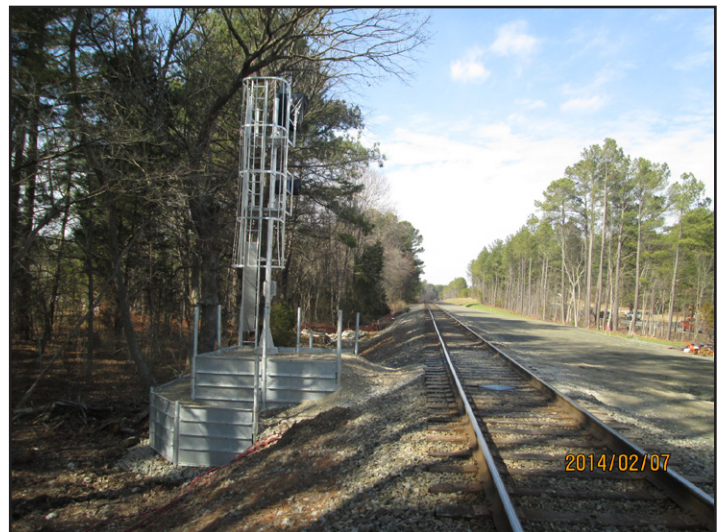
U-4716 Hopson Rd./Nelson-Clegg - Signals