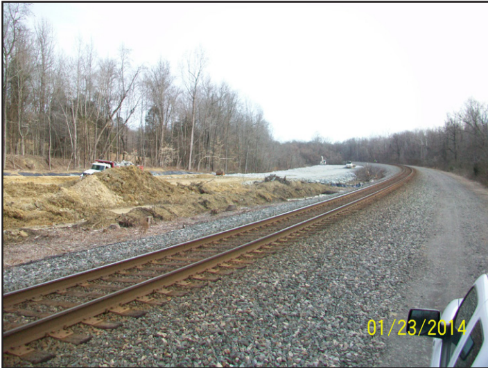
C-4901A Bowers to Lake - Rip Rap Stabilization