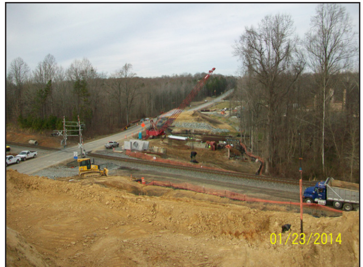
C-4901B Upper Lake Road - Bridge Construction