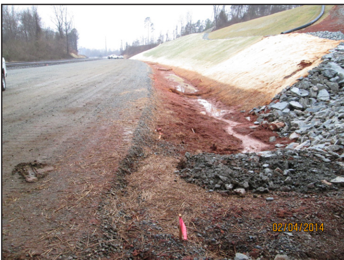
I-2304AE Duke Curve Realignment - Subballast