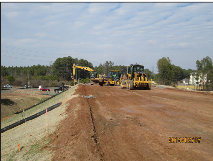
U-4716 Hopson Rd./Nelson-Clegg - Grading