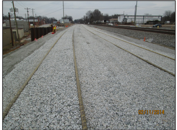
U-3469 Klumac Road - Track Ballasting