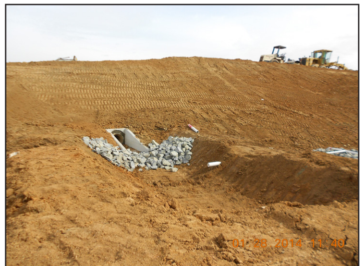
P-5208 Haydock to Junker - Grading & Drainage