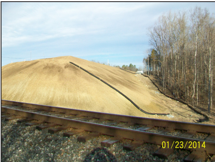
C-4901C Turner Road - Approach Fill Grading