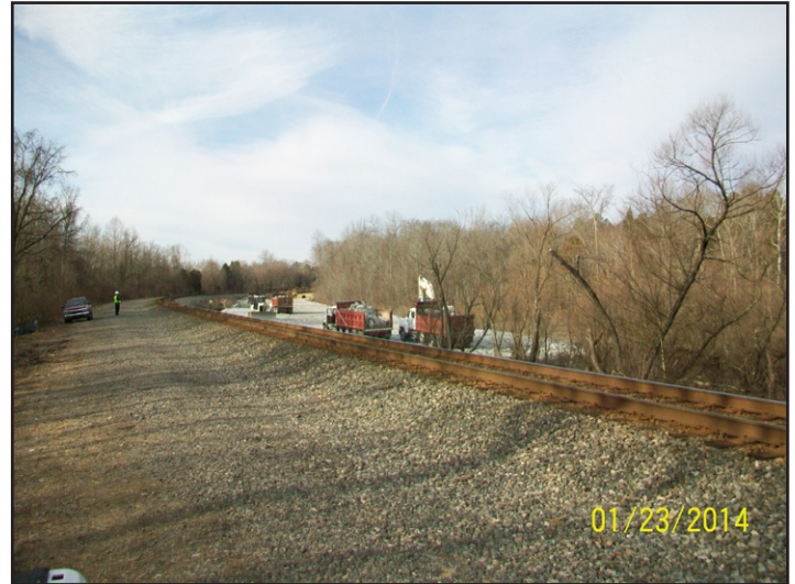
C-4901A Bowers to Lake - Rip Rap Stabilization