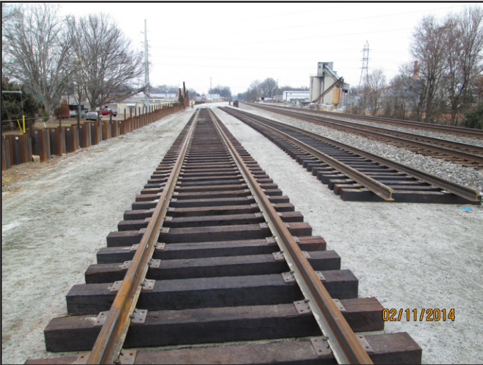
U-3469 Klumac Road - Track Installation