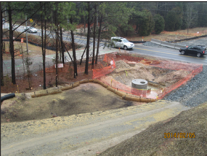
U-4716 Hopson Rd./Nelson-Clegg - Erosion Control