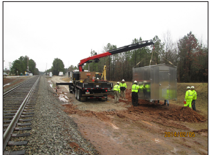
U-4716 Hopson Rd./Nelson-Clegg - Signal Cabinet Installation